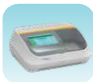
Micro Plate Reader/Washer