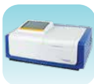
UV/VIS Spectro 2080+ Double Beam

Analytical Technologies is synonymous for offering technologies for doing analysis and is the Fastest Growing Global Brand having presence in at least 96 countries across the global. Analytical Technologies Limited is an ISO:9001 Certified Company engaged in Designing, Manufacturing, Marketing & providing Services for the Analytical, Chromatography, Spectroscopy, Bio Technology, Bio Medical, Clinical Diagnostics, Material Science & General Laboratory Instrumentation. Analytical Technologies, India has across the Country operations with at least 4 Regional Offices, 6 Branch Offices & Service Centers. Distributors & Channel partners worldwide.